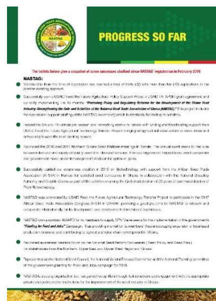
Fig 10: NASTAG Progress so far