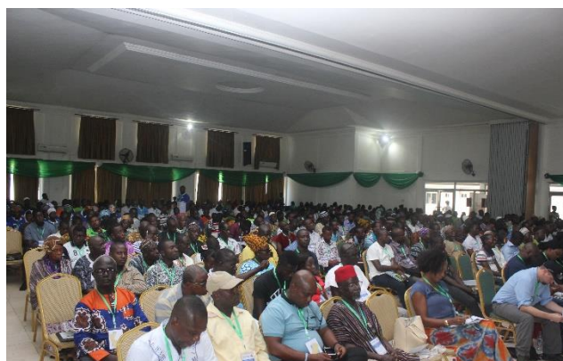
Fig 9: A section of the Participants at the Preseason Event

The Deputy Minister of Agriculture, Dr. Sagre Bambangi was the special guest and delivered the keynote address at the forum. According to him, he was happy that the theme for the event, “Quality Seeds -Necessity for food and jobs” was in line with the Government's Planting for Food and Jobs Campaign. “To us in Government or the public sector, Seed is recognized as a key input to transforming the agriculture sector in Ghana; a high-quality Seed when planted would not only result in high farm yields, but also guarantee food and nutrition security, generate employment and better livelihoods for Ghanaians in the country. This is one of the reasons, the government of Ghana has prioritized Seed as one of the pillars in its flagship agriculture sector program, dubbed “Planting for Food and Jobs” (PFJ) and working very closely with the National Seed Trade Association Ghana (NASTAG) and other private sector actors to achieve the overall goal of the PFJ initiative.” he said.