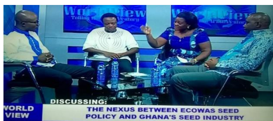
Fig 11: Discussion on the Seed Sector on GTV

Radio and TV discussion programs held: Since the seed industry has farmers as its customer, NASTAG under the grant worked closely with the Peasant Farmers Association of Ghana (PFAG); building a very close working relationship as a strategy to secure markets for local seeds produced and ultimately contributing to sustaining the seed sector businesses. This resulted to PFAG registering as a member of NASTAG and PFAG and the latter has since committed to consulting NASTAG on issues relating to seeds for our mutual benefit. The end results envisaged are enhanced business linkages, farmers appreciating the significance of use of certified seeds through rigorous sensitization and increased use of locally produced seeds through the agro-input dealers, thereby increasing agricultural productivity with increased used of high quality seeds.