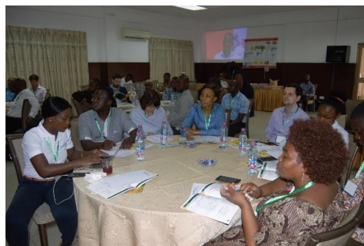
Fig 6: A section of participants at the Seed Forum