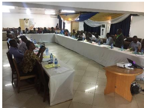
Fig 4: Stakeholder sensitization in session at Ho

Participants included development partners in agriculture especially seed producers, farmers, researchers and representatives from the regional department of Agriculture and the Ghana Seed Inspectorate Division (GSID) offices. The wide range of participants in these meetings served as a good forum to digest the implications of the policy and plan, their implications; providing a clearer understanding of the role of the private sector in the implementation of the Seed plan. The pre-presentation evaluations on the documents at these forums revealed that, on the average 50% of the participants had not seen or heard of these documents, let alone understood its implications and their own respective roles within the industry. In this context, the forums were effective in underscoring the important role that the private sector plays in the seed industry, and to discuss and agree on the priority activities that NASTAG should work on along with the GoG to create the enabling environment for increased private sector participation in the industry.