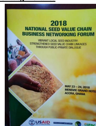
Fig 5: Brochure developed for the Event

Key highlights of the maiden National Seed Value Chain Business Networking Forum are as follows: