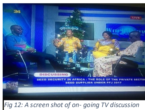
Fig 12: A screen shot of on- going TV discussion

With the APSP grants support three NASTAG EC members joined the host of the Saturday evening worldview programme on GBC24 on December 16, 2017 to discussion on the successes, challenges and the way forward on the implementation of the PFJ Campaign from the Seed sector perspective. A critical recommendation to government through this medium was the need for timely payment