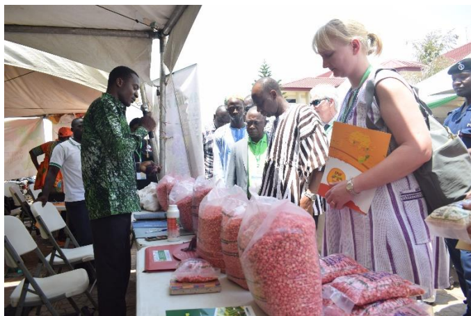
Fig 8: Dignitaries at the Exhibition stand

Hosting and Facilitation of the 8 th Pre-Season Planning and Networking Event: As part of the activities for the month of March 2018, NASTAG successfully hosted the 8 th Pre-season Planning and Networking Forum at Modern City Hotel in Tamale, on March 21, 2018. This year's event brought together over 800 agricultural value chain actors on the theme: “Quality Seed - Necessity for Food and Jobs” . The forum offered the industry players the opportunity to discuss business opportunities for the coming season. About 30 companies and