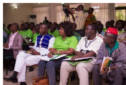
Fig17: Some participant at the NASTAG Launch

As part of the launch, a brief ceremony saw the seven (7) newly elected substantive Executive Council Members of the association inducted into