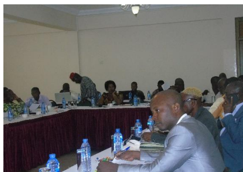
Fig 2: A session of Participants at the Maiden AGM

The actual day of the official launch of the Association saw the seven (7) substantive Executive Council Members officially inducted into office in a brief ceremony. This included the President, the Vice President, Treasurer, General Secretary and three zonal representatives for the Southern, Middle and Northern zones of Ghana. The official launch of the Association proceeding is reported in fully under section 3.3.3- NASTAG official Launch