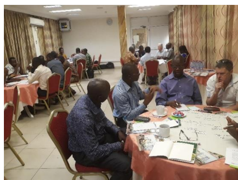
Fig 13: Participates in a Group Discussion

The consultative meetings were held in January 2018, to restructure NASTAG's draft 3-year SP into a 5-year results based one. The information gathered from the consultative meeting was used by the consultant to carry out a desk work in February 2018.