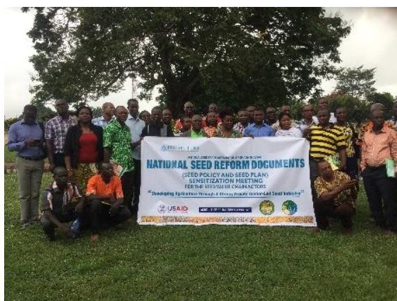
Fig 3: A group picture of participants after a Sensitization Forum Meeting

Programs, to contribute meaningfully in the sector reforms process. Under the grant, NASTAG embarked on series of stakeholder sensitization/education forums on seed sector reform documents across the three zones in Ghana. The purpose of the forums was to: i). draw attention of both public and private sector actors to national reform documents; ii) get a common understanding of their contents; iii) identify each stakeholder’s roles and responsibilities in the operationalization of the documents; and iv) more significantly enhance public-private collaboration and dialogue to facilitate the effective implementation of the documents. Essentially, this activity was designed to increase awareness and enhance the understanding of the seed public and private sector stakeholders on the seed law, seed policy, seed plan and relevant seed policy regulations and programs.