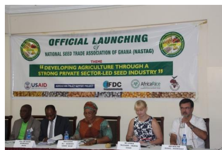
Fig 15: some dignitaries at the NASTAG launch