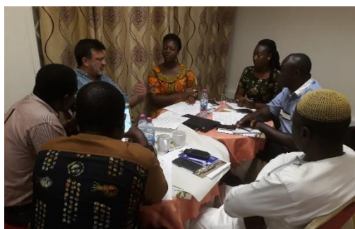
Fig 14: A session of the group at the Strategic Plan validation meeting

The month of March 2018 was thus dedicated to preparation for a working meeting to validate the 5- year Plan put together by the consultant's and was subsequently held March 26, 2018 at the Airport West Hotel in Accra bringing together a total of 35 participants. This was made up of 16 NASTAG members, 4 NASTAG staff, 3 APSP Staff, 2 IFDC/ ATT Staff, one (1) USAID staff, and other 3 other development partner representatives