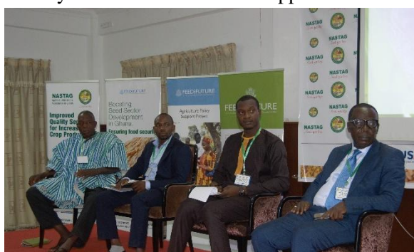
Fig7: Panelist discussion of Planting for Food and Jobs and its impact on the Seed Sector in Ghana

○ USAID initiatives, through APSP and Agriculture Technology Transfer Project were commended and asked for a good transitional arrangement to enhance continuity of the initiatives.